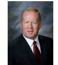
Sarpy Hils District 1 Commissioner

Geographic Information Systems Department 1210 Golden Gate Drive Papillion, Nebraska 68046 http://maps.sarpy.com/sims20/